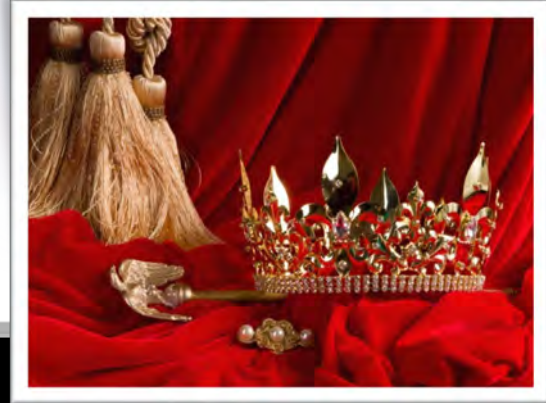
The King God