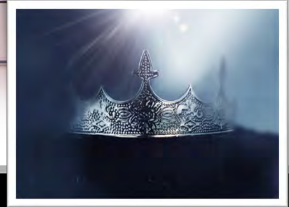
King's Son Jesus Christ