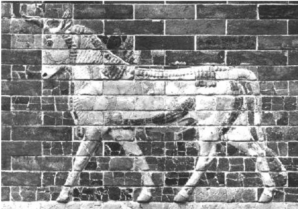
Fig. 5 Bull on glazed brick, from walls of ancient Babylon