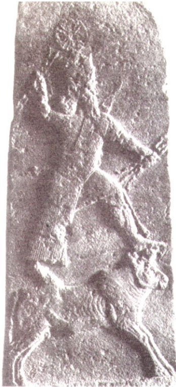
Fig. 6 Storm god astride a bull, with lightning bolts in his hand. From Arslan-Tash, 8th cent. BC.