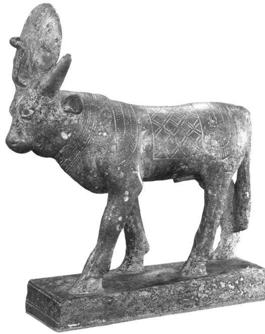
Fig. 4 The Egyptian god Apis, the bull-calf of Memphis