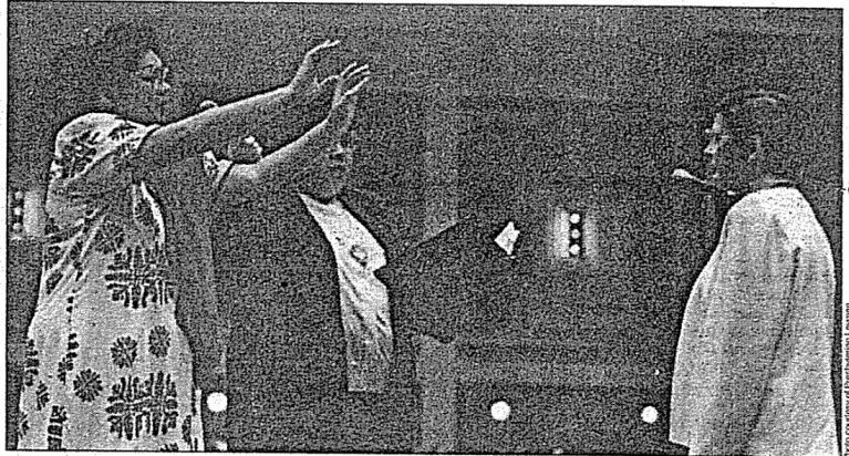
A speaker receives a blessing from the goddess Sophia at "Re-Imagining 1993," a pseudo-Christian conference promoting goddess worship and lesbianism, funded by the PC(USA).