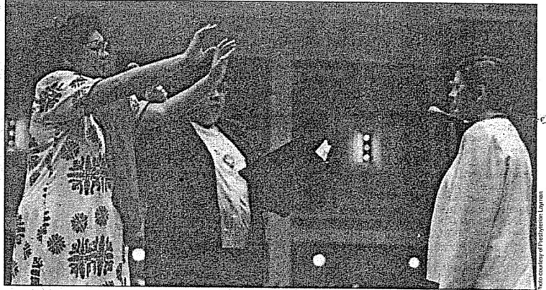
A speaker receives a blessing from the goddess Sophia at "Re-Imagining 1993," a pseudo-Christian conference promoting goddess worship and lesbianism, funded by the PC(USA).